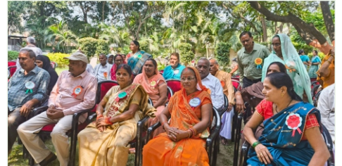
Grand parents' Day