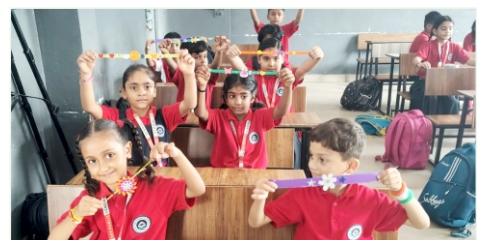
Rakhi for our soldier brothers