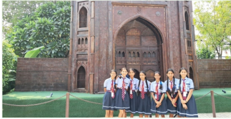
UP Darshan Park