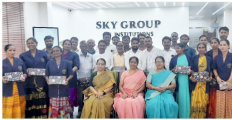
Labour Day (our helping hands)