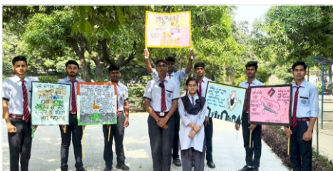
Voting Awareness Campaign