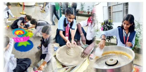
Mini Diwali Mela