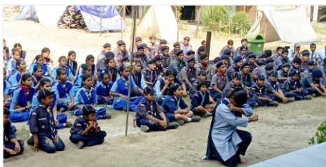
Scouts & Guides