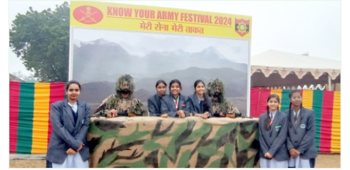
Know Your Army