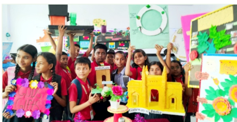
Art & Craft Exhibition